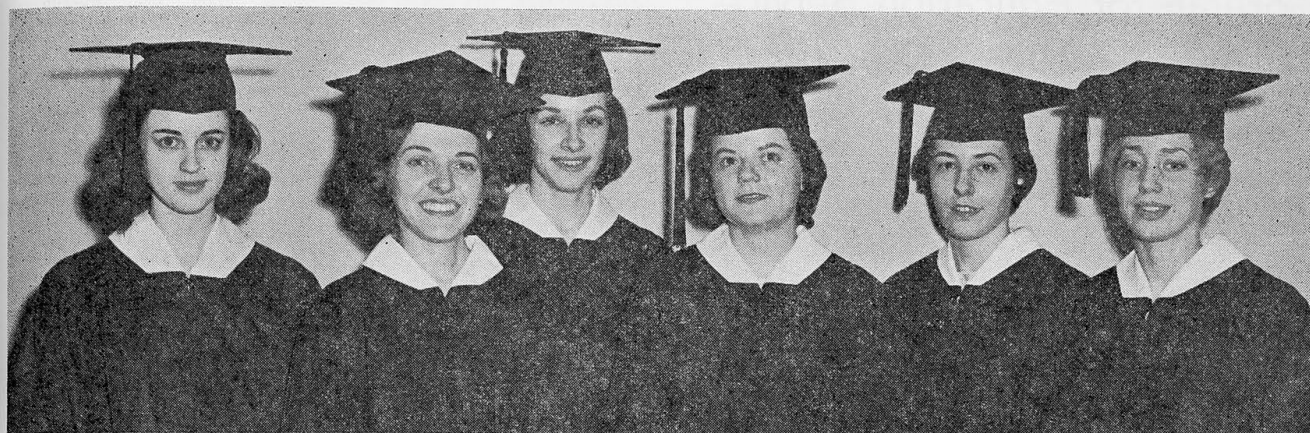
Elected by faculty vote to the Honor Society, Kappa Gamma Pi, are the six seniors pictured above. Each student has at least a 2.5 honor