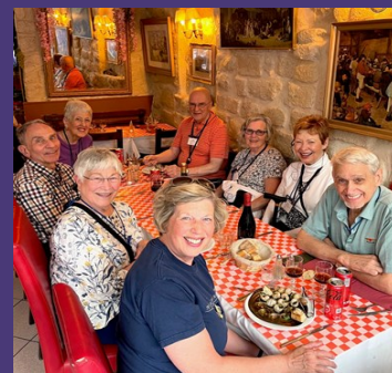
FCC Also Well Represented on the Centennial Trip to France