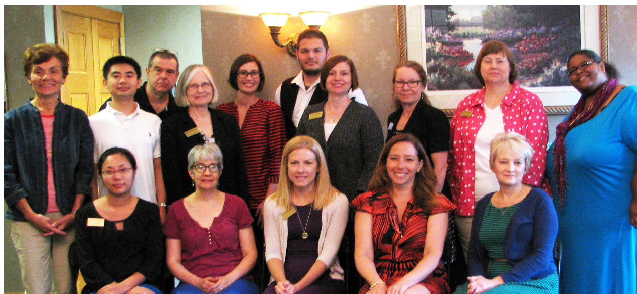
FCC 2015-16 awardees celebrate funding for their creative projects.