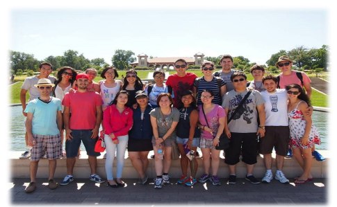
International students and mentors.

The stewards of this FCC award did a wonderful job surveying students and evaluating experiences. Eighty-three percent of international students served said First Leaders programs made their transition to Fontbonne a good experience. Ninety-four percent said they would recommend the program to other students, and 73 percent felt it increased their independence in making life decisions.