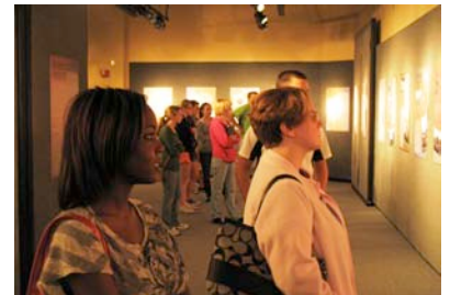
Fontbonne students viewing the exhibit at SIUE.