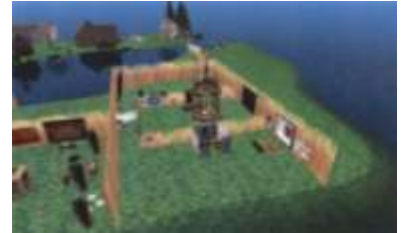
Added Worship Spaces